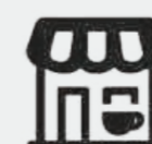
Retail & Cafés