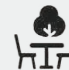
Landscaped Outdoor Seating