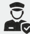
24/7 Security & Concierge